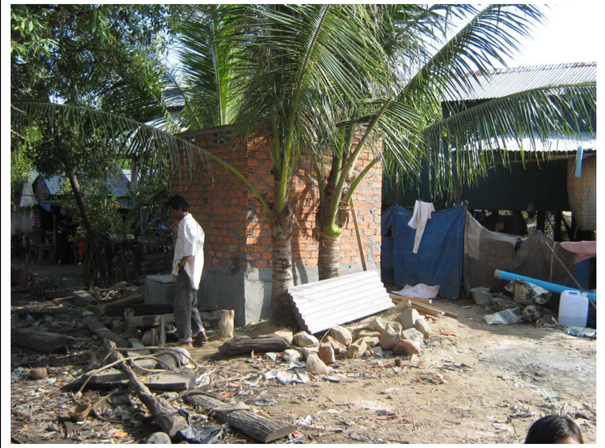
Above: construction nearing completion. zinc walls replaced by brick which raised the cost plus the group requested an apron of cement around the toilet to keep area usable in wet season